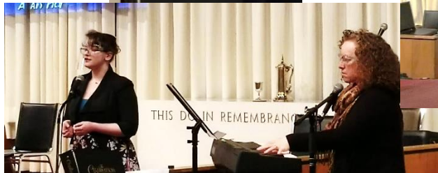
Young Adults, youth and the young at heart! :)