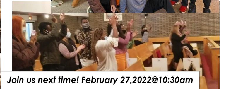
Join us next time! February 27, 2022@10:30am