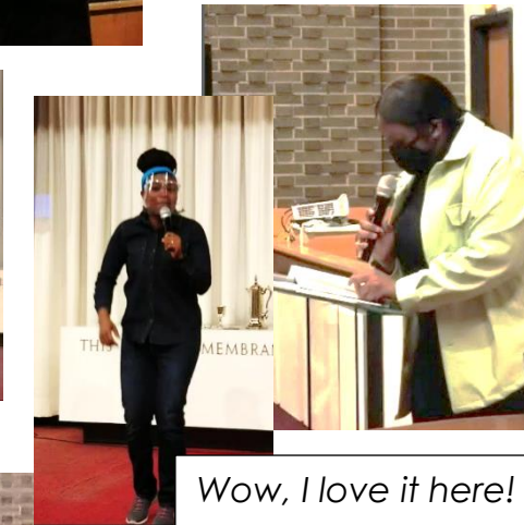
Wow, I love it here!