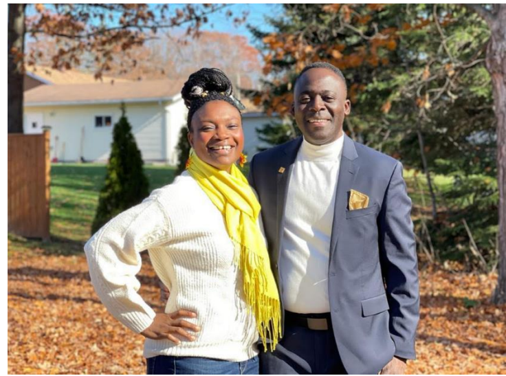
"Then I will give you shepherds after my own heart, who will lead you with knowledge and understanding". (Jeremiah 3:15)

This entire scripture is loaded with components that can be totally relevant to us all, but I'd like us to take a look at one word. The word "Shepherd". I'm not sure how many of us here are familiar with farming but I looked up the duties of a Shepherd and I was amazed at how relevant the use of the word was to our lives right here in this Church. Allow me to give you a quick example of the main duties of a Shepherd.